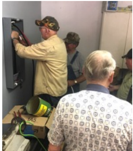
Feeding the Wire. Wire was pulled into the depot panel.