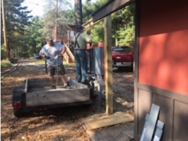
Feeding the Wire. Wire was pulled from the buried conduit at the panel,