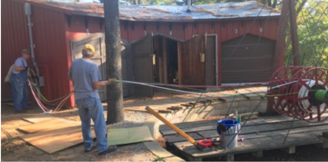
Feeding the Wire. Wire was next fed from the spools into the junction box to the main panel board box.