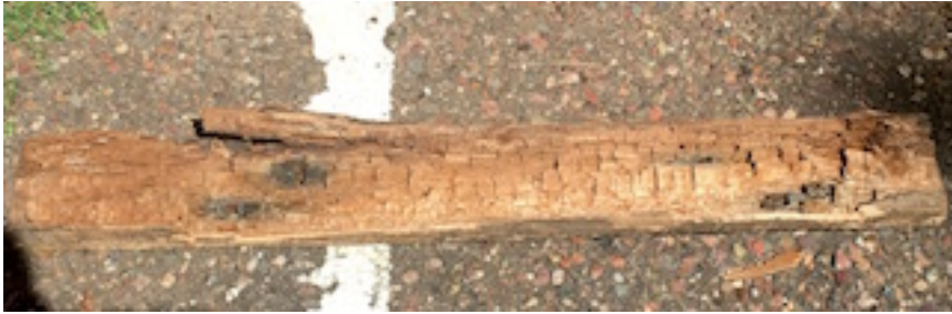
Bottom of old tie removed. Half gone