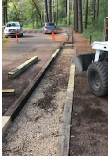
New Timbers at edge of asphalt