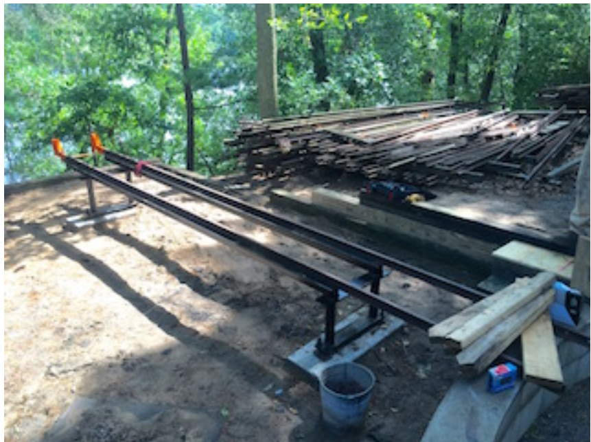
New steaming bay. In the background the small retaining wall is under construction.