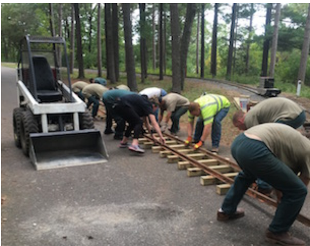
Skidding new track section