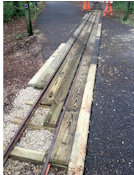
Track in place and new decking