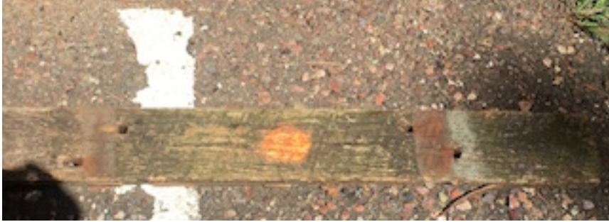
Top of old tie removed. Looks Ok but —